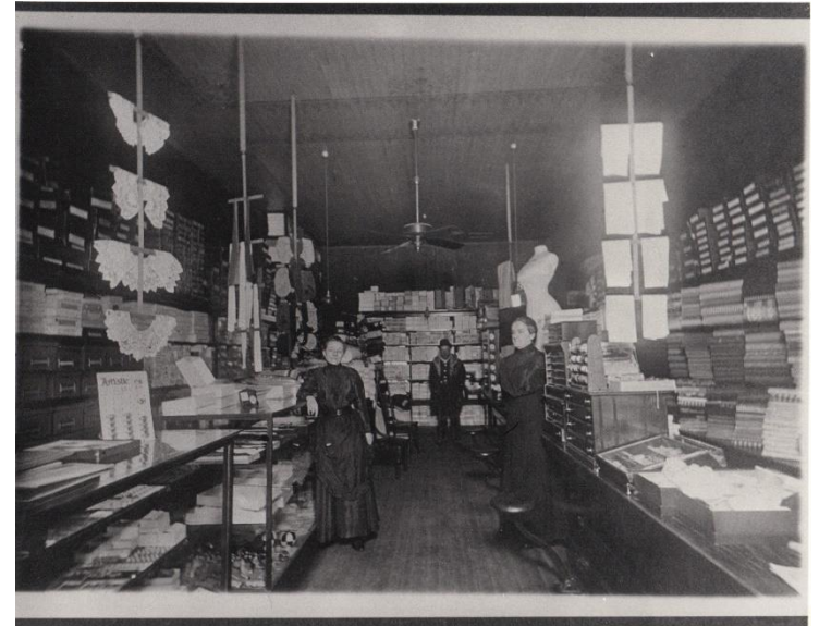
The west side – dry goods. The white pieces hanging from the ceiling are women's collars. The stools on the right were used by ladies to leisurely examine dress patterns.

Open Houses Returning – We Think! With the virus tamping down and mask regs loosening up, we are tentatively planning on Open Houses this summer. To find out more – dates, hours, etc. – hit our Facebook page (address above) for details. Also, if your group would like to set up a special tour, please contact one of th board (contact information below.) We've added a lot of new artifacts since our last open houses in 2019.