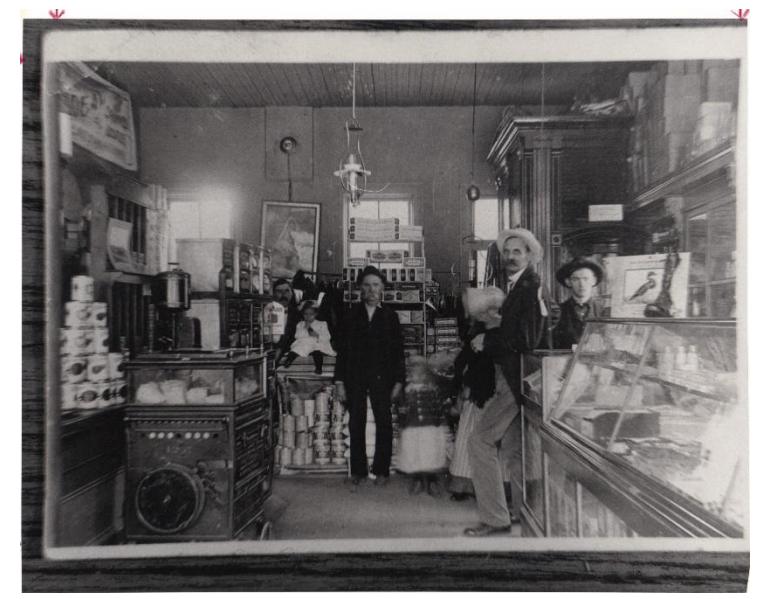
The equipment directly above is a peanut roaster and popcorn machine. The white box above it is a container of "white" gasoline, used to heat the roaster. Do you remember those old fans in stores before air conditioning became the norm?