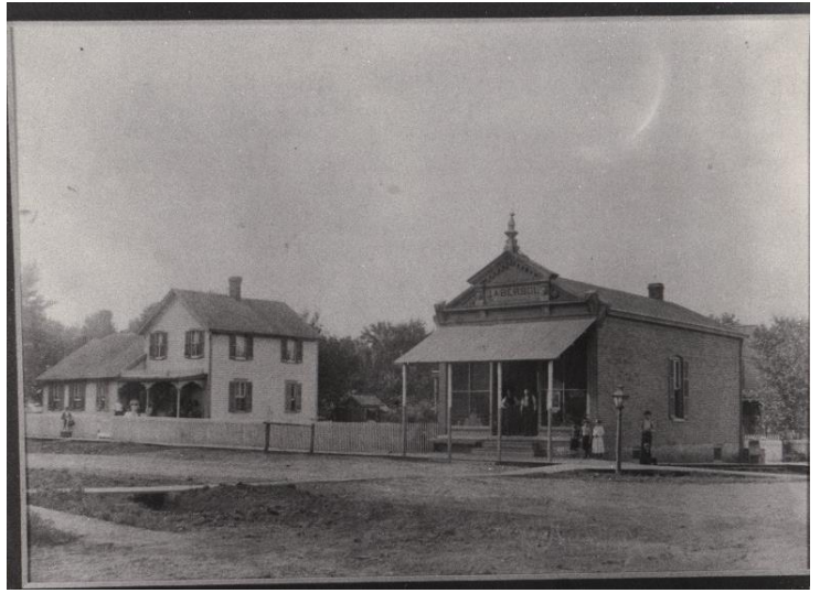
The original brick store was build in 1871. The matching wing was added in 1901. It was orginally known as Abersol Corners.